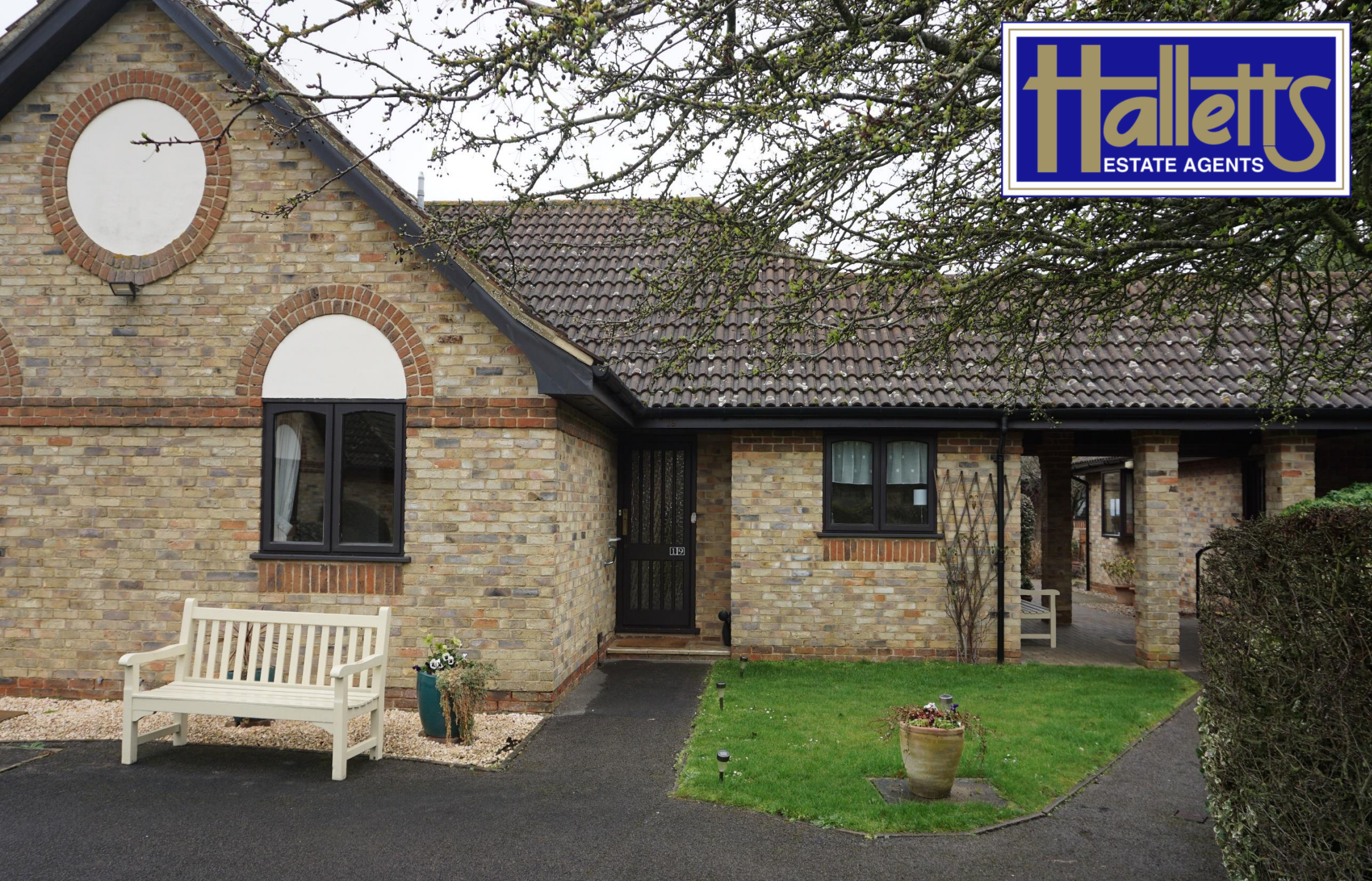
19 The Maltings Thatcham Berkshire RG19 4YB